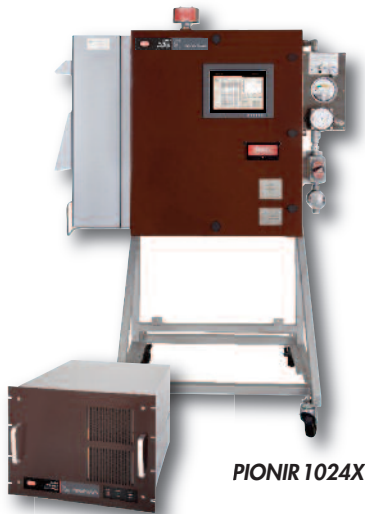
PIONIR MVP+ Rackmount